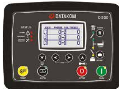
D-500LITE MK2 control operator / display panel