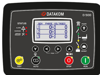
D-500LITE MK2 control operator / display panel