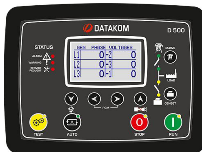
D-500 MK2 control operator / display panel