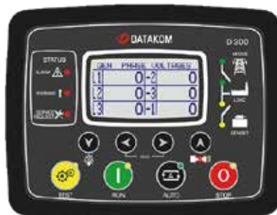
D-500 MK2 control operator / display panel