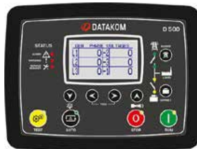
D-500LITE MK2 control operator / display panel