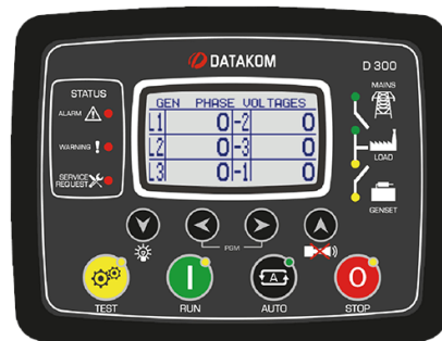
D-300 MK2 control operator / display panel