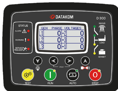
D-300 MK2 control operator / display panel