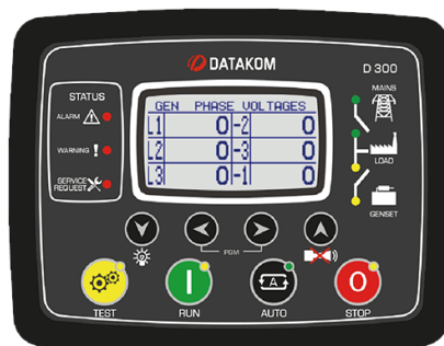
D-300 MK2 control operator / display panel